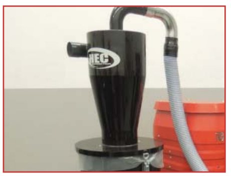
HEC Pre-Separator filters out submicron particles before they reach the vacuum's primary filter

About Ruwac's Industry-Leading MicroClean Filtration